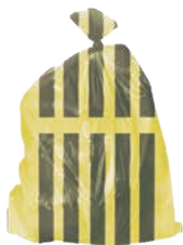
Yellow sack with black stripes

Contact us to sign up to this free collections service