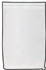
Small white bag