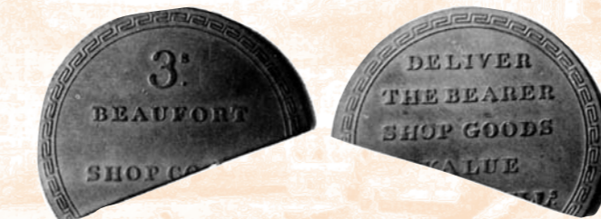
Beaufort Truck Token

From the small bridge continue to the A4047. To your left, running behind the Rhyd y Blew Inn, was a branch of the Trefil Railroad that ran to Beaufort Ironworks.