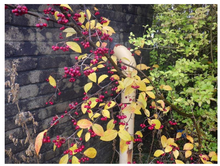
Hollyberry Cotoneaster at TN7.

Only one species of non-native invasive plants was recorded during the survey. Hollyberry Cotoneaster was seen in several locations, particularly at the site boundary near TN7 and TN19. This is discussed further under 'ecological constraints'.