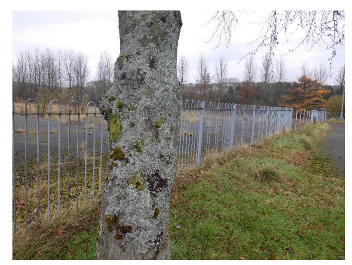
Abundant lichens and mosses on the standard Beech west of TN12.

The trees within the site are mostly remnants from the former school grounds, and they include a mix of native and non-native species (including the old ornamental planting beds). The trees do not appear to have any special value for nature conservation, although there is a very low risk that holes in one Birch tree (TN4) might be accessible to bats or birds. Some of the standard trees support a good covering of mosses and lichens. The species that were identified growing on the trees are all common species, but their presence and diversity probably indicates good air quality in the general area.