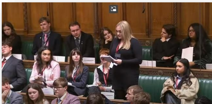
House of Commons Debate 2023