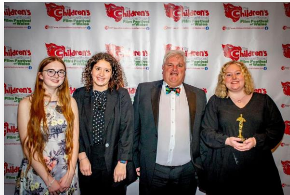
The Children's International Film Festival Awards October 2023

The Youth Forum developed a Climate Change Film for primary schools which has been shared on social media and with the primary schools across Blaenau Gwent