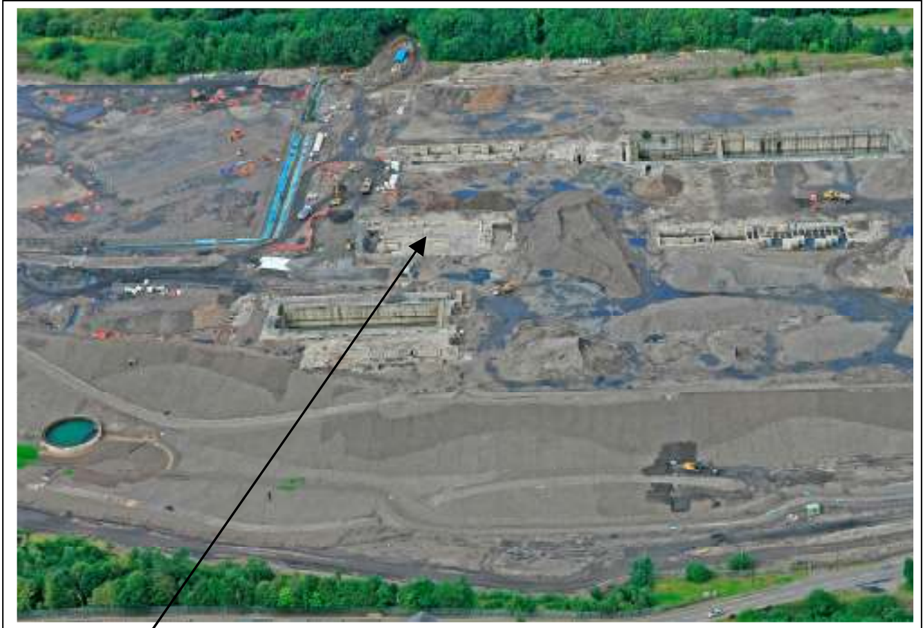
No. 4 Motor Room, August 2008.

As the pictures show the site has changed and will continue to change over time. This design is for the Eisteddfod, then there may be some time when people can't access it, for example when building takes place nearby. The final use will change to give an area for young people as the site is finished.